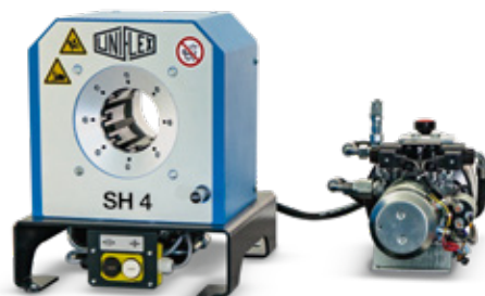
SH 4 Mobileline